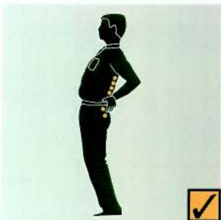
B.8 Back arching