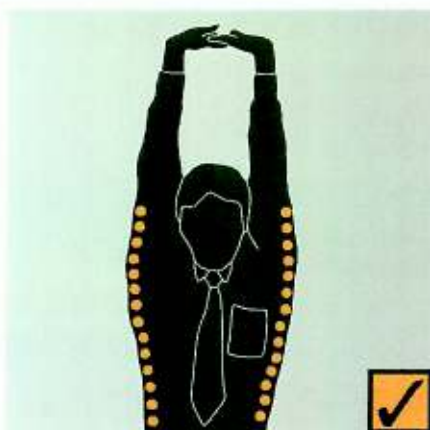
B.7 Upper and lower back stretch