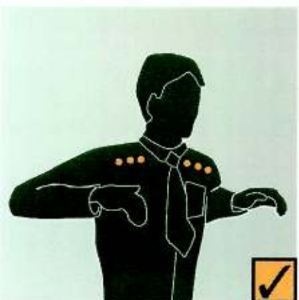
B.9 Pectoral stretch