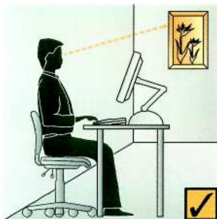
B.12 Visual rest