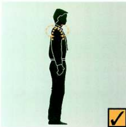
B.4 Shoulder rolls