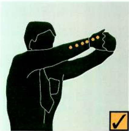
B.5 Wrist and elbow stretch