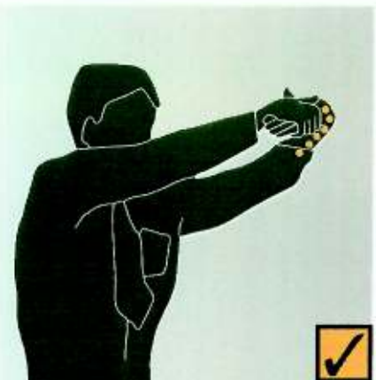
B.6 Wrist stretch