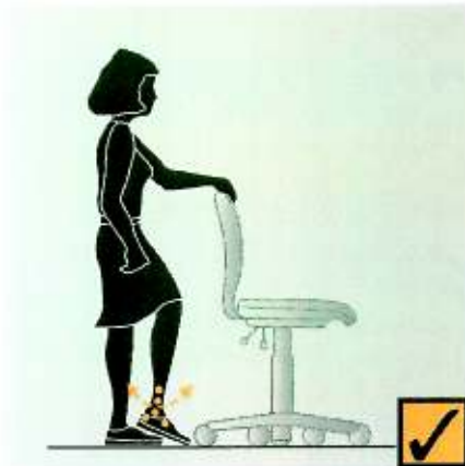
B.10 Foot pump