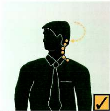
B.2 Head turns