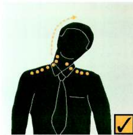
B.1 Neck stretch